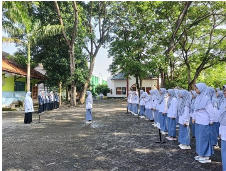
Figure. 2 Morning assembly

of shared order that strengthens behavioral cohesion. Habit formation is effective because it is comprehensive, consistent, and supported by the pesantren's disciplinary structure.