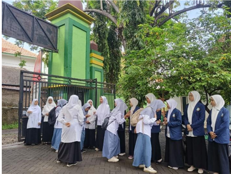
Figure. 1 Morning welcome

Figure 1 shows the morning greeting ceremony at MAN 1 Probolinggo, which is one of the habitual practices that plays a central role in the process of internalizing the values of discipline and religious character in students. Based on the documentation, it can be seen that educators and counselors consistently welcome students at the madrasah gate every morning. This activity is not only a form of respect and strengthening of the emotional bond between teachers and students, but also serves as a mechanism for controlling discipline in terms of punctuality. The documentation data in Figure 1 also shows that students who arrive early demonstrate positive responses, such as greeting teachers, tidying up their uniforms, and behaving politely before entering the learning environment. This welcoming routine creates a religious and orderly atmosphere from the start of the day, thereby strengthening the madrasah culture that is oriented towards the continuous formation of disciplined behavior.